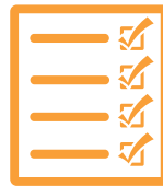
MEET ELIGIBILITY REQUIREMENTS