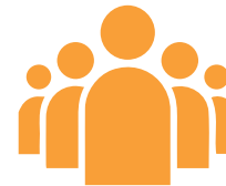
ALL EMPLOYEES PARTICIPATE & BENEFIT

You can contribute up to 100% of your salary to your new 401(k), up to the annual limit. If you're age 50 or older, you can also make catch-up contributions to maximize your retirement savings.