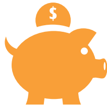
SETUP & MAINTAIN 401(K)

The ROBS process requires you to set up and maintain a 401(k) plan for your corporation, which offers a major competitive benefit. Every employee of your business, including you — the owner — is offered participation in your new 401(k) plan once eligibility requirements are met.